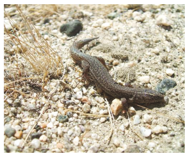
Fig. 1. Xantusia vigilis from the Mojave Desert, Los Angeles County, California.